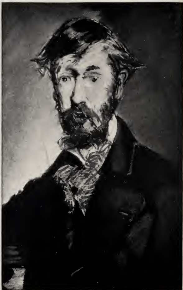
Portrait by Manet.